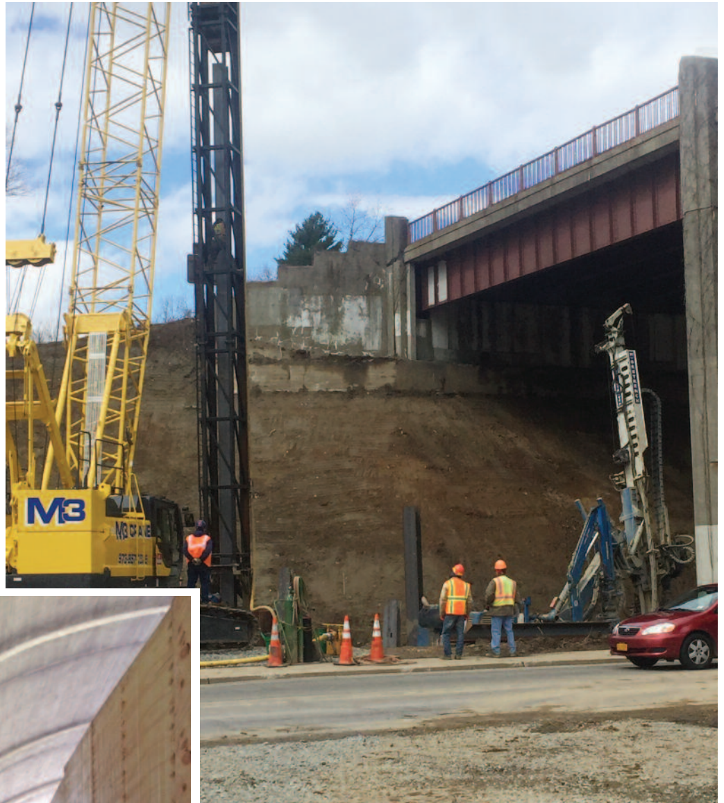
ECCO III driving H-piles while Moretrench's MC 1200 installs battered piles under the Kisco bridge.

The abutment piles were drilled from the Saw Mill Parkway roadway during night work under a Parkway closure. The majority of the piles were drilled with a low headroom rig to allow access underneath the overhead stone arch bridge, but the few piles that were outside of the overhead footprint were installed using a much larger MC 1200 drill rig to expedite the schedule and increase the production. Moving the equipment on and off the Parkway each night was well coordinated by ECCO and minimal downtime was achieved. ECCO also devised a road plate system that fit together like a puzzle along the alignment of the abutment. This allowed for controlled spoils clean-up below the roadway elevation and covered