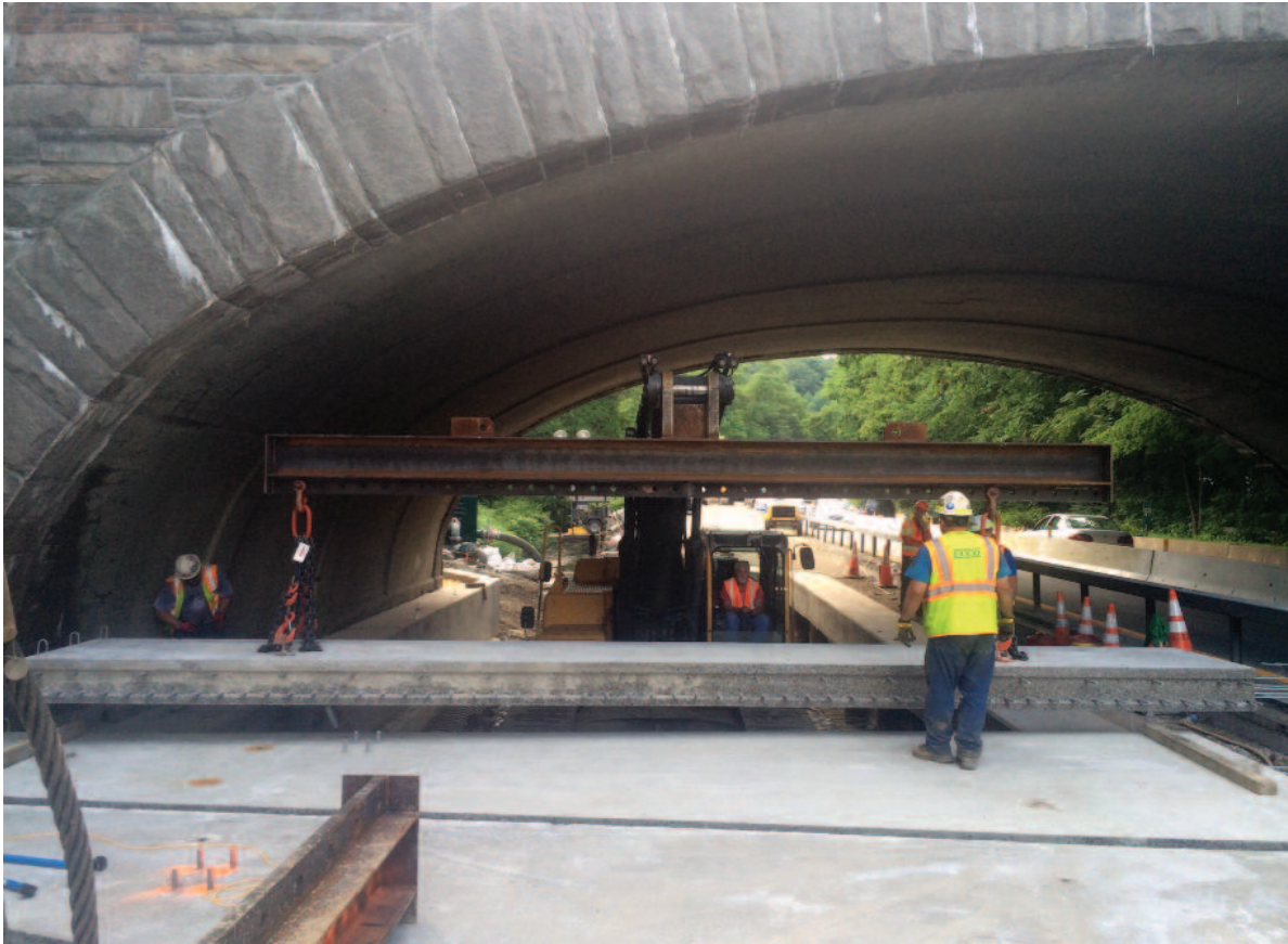
ECCO III setting superstructure precast concrete slabs.

accessible during the nightly shift, ECCO completed all river pile and substructure work falling under the footprint of the southbound Parkway lanes. ECCO first established a road plating system using skid resistant plates securely anchored and recessed into the existing pavement. On a nightly basis, ECCO removed plates as necessary to allow excavation, drilling and installation of micropiles by Moretrench, construction of a reinforced concrete pile cap, completion of the proposed substructure connection to the existing retaining wall and, in general, completion of all east side substructure preparatory work necessary prior to the implementation of the full 24/7 detour superstructure phase.