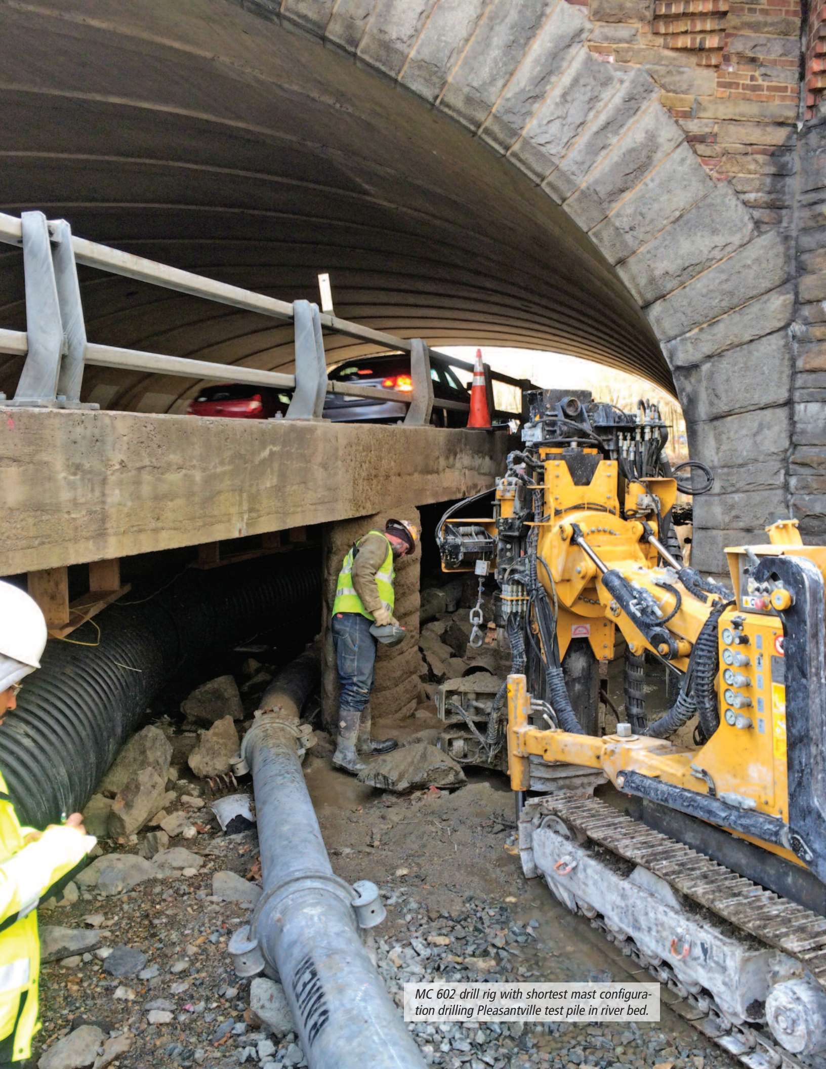
MC 602 drill rig with shortest mast configuration drilling Pleasantville test pile in river bed.