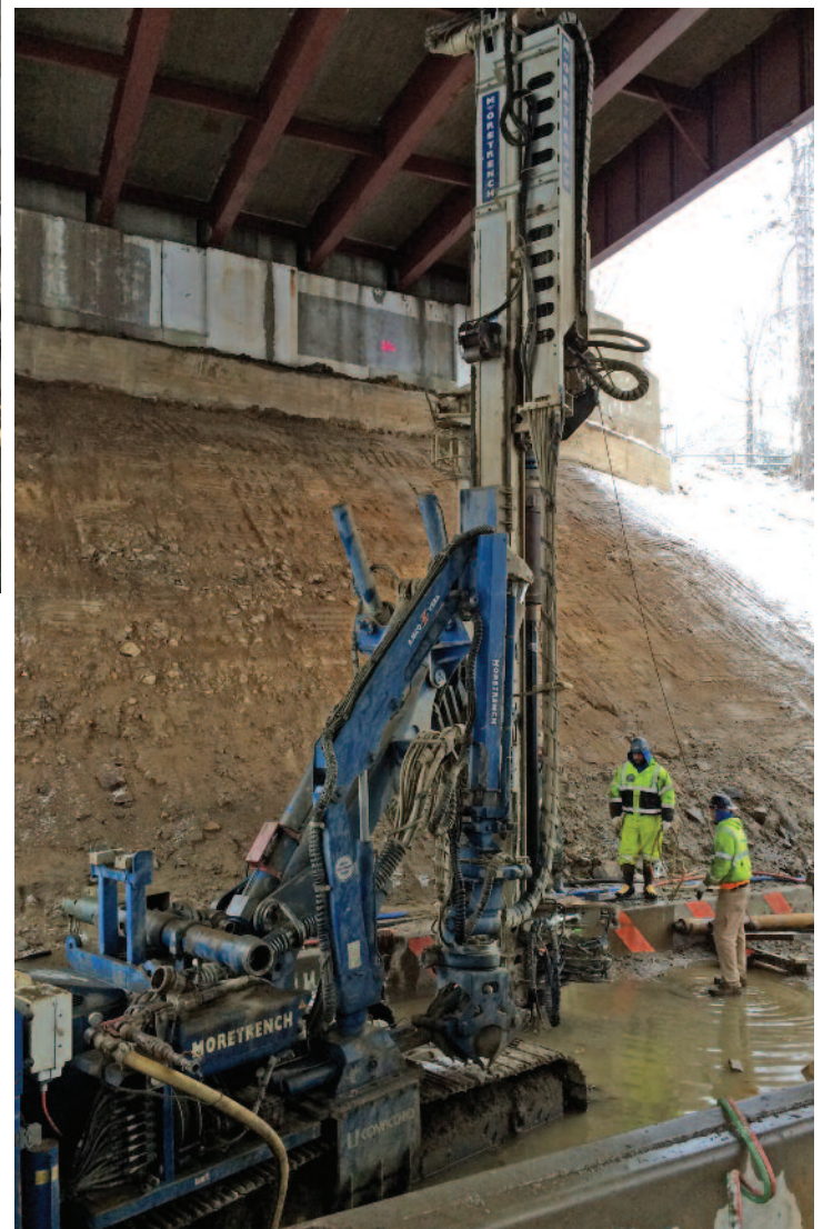
Moretrench's MC 1200 working beneath the Kisco bridge where more headroom was available.

During the design stage, the selection of the 3-in. long threaded joint did not appear to have any construction impacts; this was not the case in the field. In tough drilling situations, i.e. the rounded river gravels, the extra-length thread presented quite a challenge for the drill crew. While drilling through the gravels, the drill rig's alignment could be thrown off the pile location and thus disturb the alignment with the threads. While a typical thread length is 2.5-in. in length, the 3-in. length was not as forgiv-