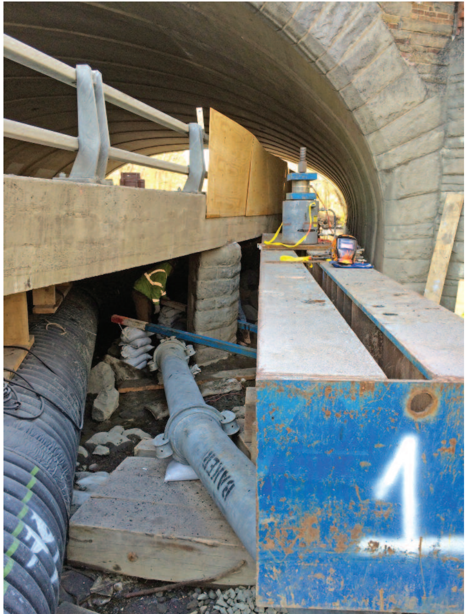
Tension load test underway in Pleasantville river bed. Note the diverted river piping and guardrail protection.

Rather than compression testing, tension load tests were conducted at Pleasantville and Bedford, in part to reduce the testing time required and also to eliminate the need for two additional reaction anchors per test. A 2-cycle loading sequence was utilized in an attempt to take the sacrificial test piles to failure. Both test piles were instrumented with spot-weldable strain gauges to monitor load transfer throughout the pile.