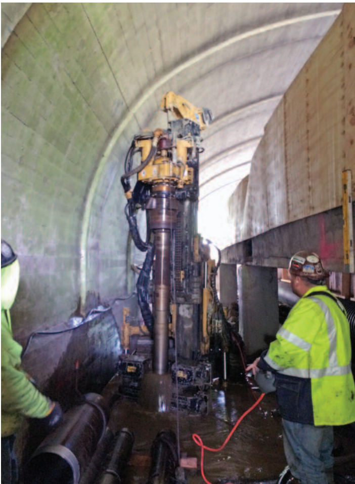
Working within the confines of the Bedford stone arch bridge next to active traffic lanes.

Bedford & Pleasantville Locations: With both southbound lanes (continued on page 22) ►