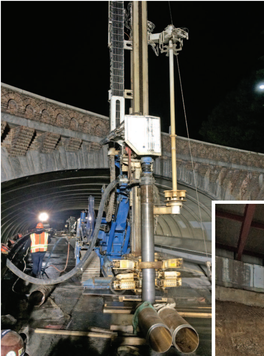
MC 1200 rig drilling the few abutment piles with no headroom restriction.

test pile into the competent rock so that a load test could be conducted to verify the rock bond stress. The team attested that the load test results from the less competent Pleasantville soil bond zone would be a conservative underestimate of the decomposed/weathered rock bond stress at Bedford. The test was loaded in two cycles and on the second cycle failure was obtained at 290% of the design load where the load settlement curve exceeded the Davison Offset Limit. The net result of the Bedford testing yielded two different design scenarios depending on which stratum was encountered during production. Either a soil-type bond zone was constructed 20.5-ft. in the decomposed rock or a 5-ft. bond zone was constructed in more competent rock.