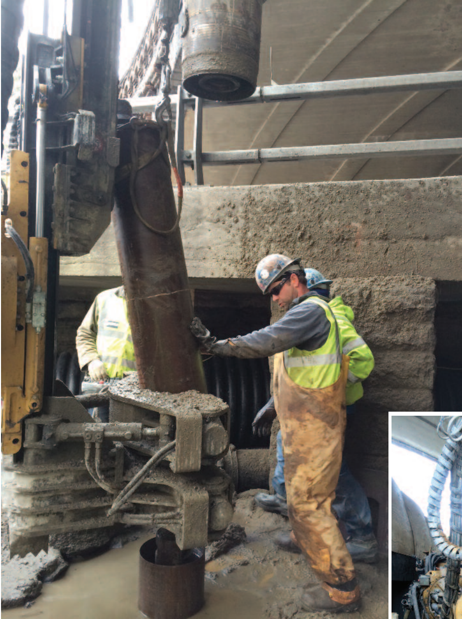
Dockbuilders working the front of the MC 602 to add another section of casing.

sand. At Mount Kisco, the grade level fill was 11 to 13-ft. thick underlain with a 30 to 37-ft. thick stratum of dense glacial till (sand with silt and gravel) followed by gneiss bedrock.