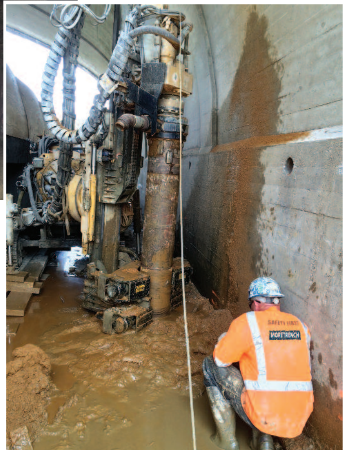
Dockbuilder signaling the driller to line up the 3-in. long threaded joint during drilling of gravels within the tight constraints and slippery work surface associated with the river-bearing piles.

The design intent at Bedford and Mount Kisco was to case the micropiles through the soil and decomposed rock and bond them within the poor to fair quality bedrock. At the Pleasantville location, rock was not anticipated within the pile depth, therefore a bond zone in the dense till was utilized for the design. At Bedford and Pleasantville, the abutment micropiles were re-